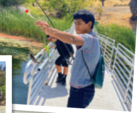
From left: Teen Eco Action Week participants at Miller/Knox Regional Shoreline and Contra Loma Regional Park.