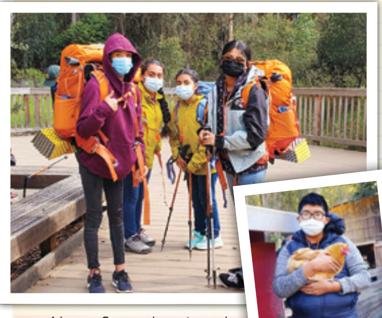
Adventure Crew members enjoy a trek from Wildcat Canyon Regional Park to Tilden Nature Area in summer 2022.