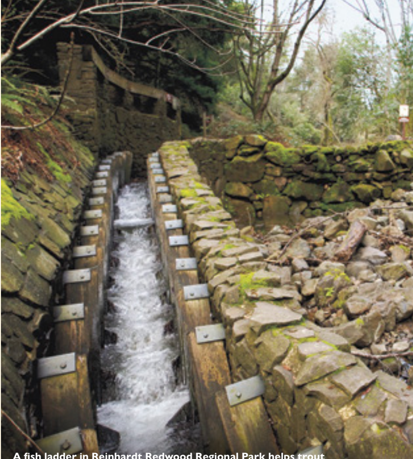
A fish ladder in Reinhardt Redwood Regional Park helps trout migrate up Redwood Creek from Upper San Leandro Reservoir.

The acquisition of the Finley Road Ranch Property adjacent to Morgan Territory Regional Preserve and Mount Diablo State Park forever preserves 768 acres of pristine open space.