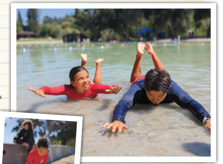
From top: A junior lifeguard at Cull Canyon has fun while learning; a student practices infant CPR skills at Robert W. Crown Memorial State Beach.

"Junior guards is a fantastic program that teaches kids valuable life (and lifesaving!) skills in a fun, supportive, energetic environment. We recommend the program to everyone we know," enthuses another family.