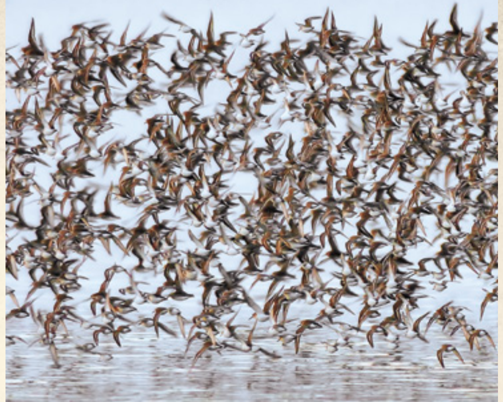
From left: A native plant habit at Ardenwood Historic Farm provides nectar sources for overwintering monarch butterflies; sandpipers take flight at Hayward Regional Shoreline.