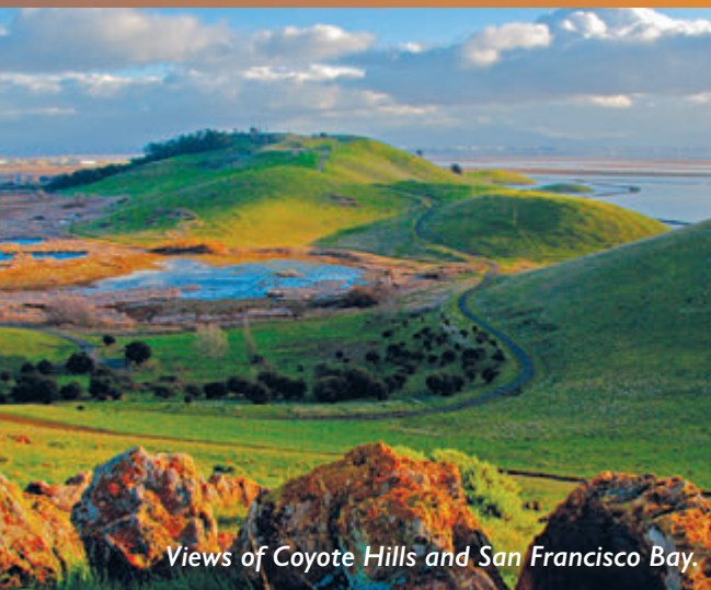
Views of Coyote Hills and San Francisco Bay.