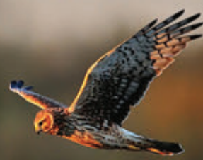
A hunting northern harrier.