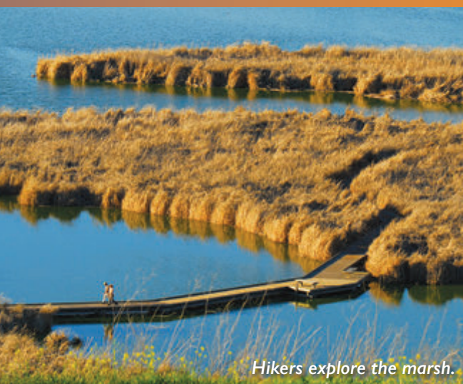
Hikers explore the marsh.