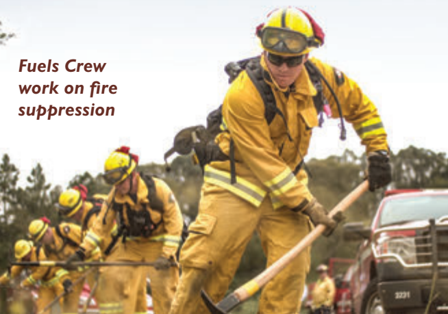
Fuels Crew work on fire suppression

The Park District proudly supports a year-round Fuels Crew. East Bay Conservation Corps members would qualify for permanent crew positions as they become available and would be encouraged to apply.