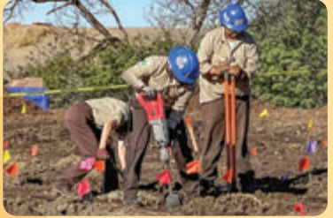
CCC workers build a butterfly garden at Oyster Bay Regional Shoreline, San Leandro

Bollinger Canyon to host two CCC crews safely and healthfully. Approximately $25 to $30 million is needed for these permanent facilities.