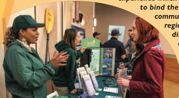
East Bay Regional Park District youth job fair