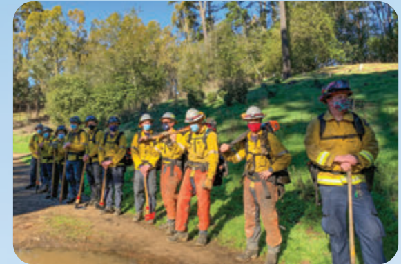
Regional Parks year-round Fuels Crew