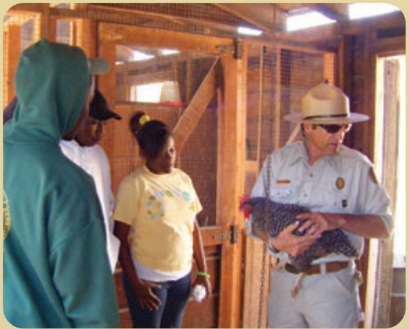
Conservation Corps participants are introduced to environmental education in Ardenwood Historic Farm, Fremont