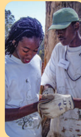
Bay Area youth find career opportunities in the East Bay Regional Park District

The Park District has long benefited from the work of Conservation Corps. From 1933 to 1942, Civilian Conservation Corps (CCC) and Works Progress Administration (WPA) workers built original Park District infrastructure. Much of this infrastructure still stands and is enjoyed by visitors daily.