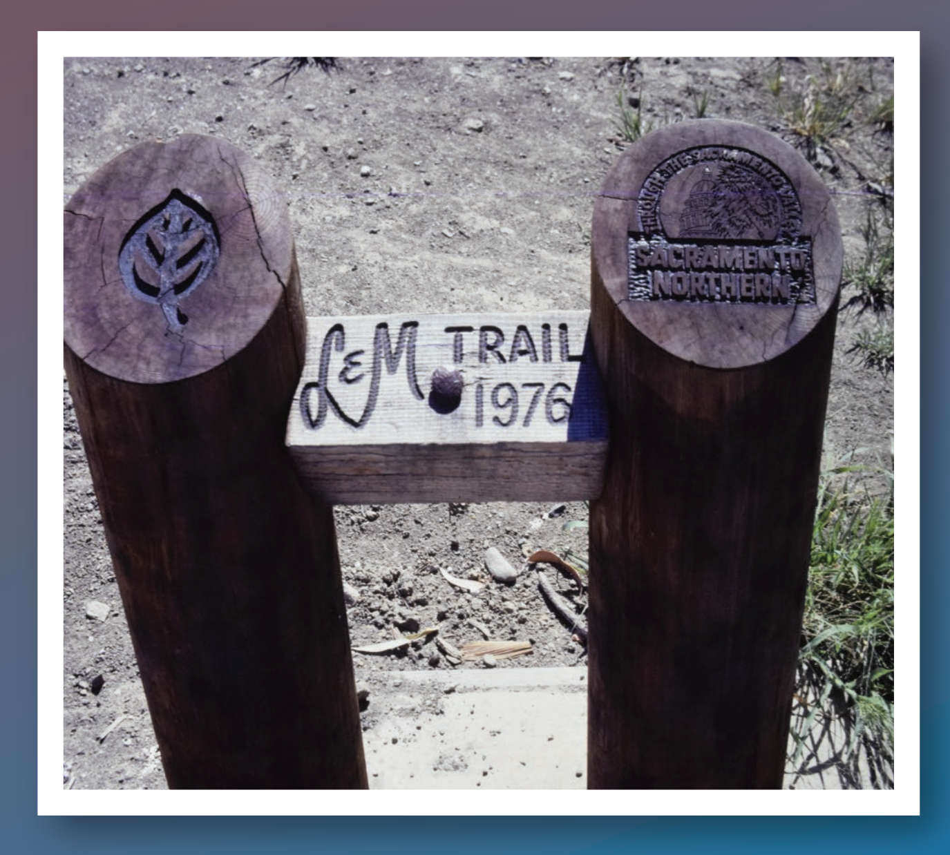
taken in June of 2021 near the original dedication site.