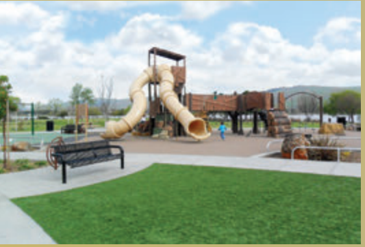
Citywide Play Area upgrades, Fremont $2.7 million