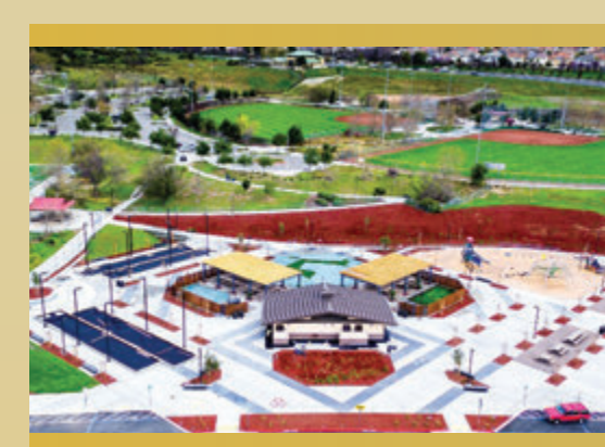
Fallon Sports Park synthetic turf, Dublin $1.1 million