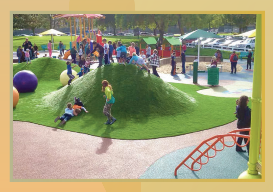
Heather Farm Park All-Abilities Playground, Walnut Creek $350,000