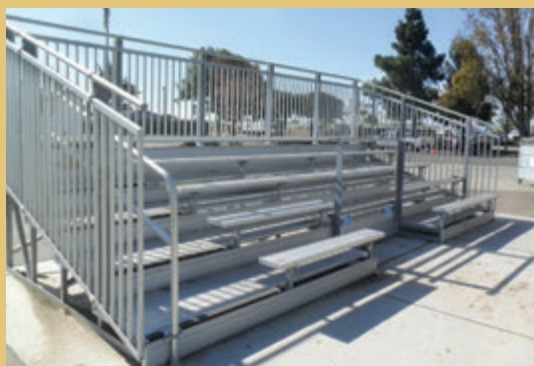
Stenzel Park bleacher replacement, San Leandro $96,000