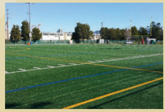
Estuary Park athletic fields, City of Alameda $500,000