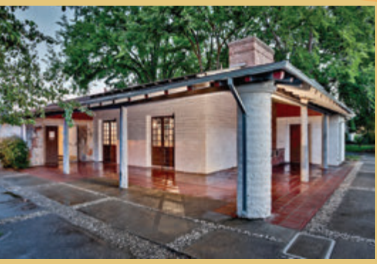
HARD Adobe Art Center, lighting and security upgrades, Castro Valley, $25,860