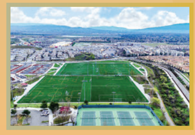
Dublin Sports Grounds $864,958