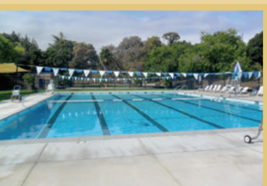
Ambrose Park refurbishment, Bay Point $1,127,177