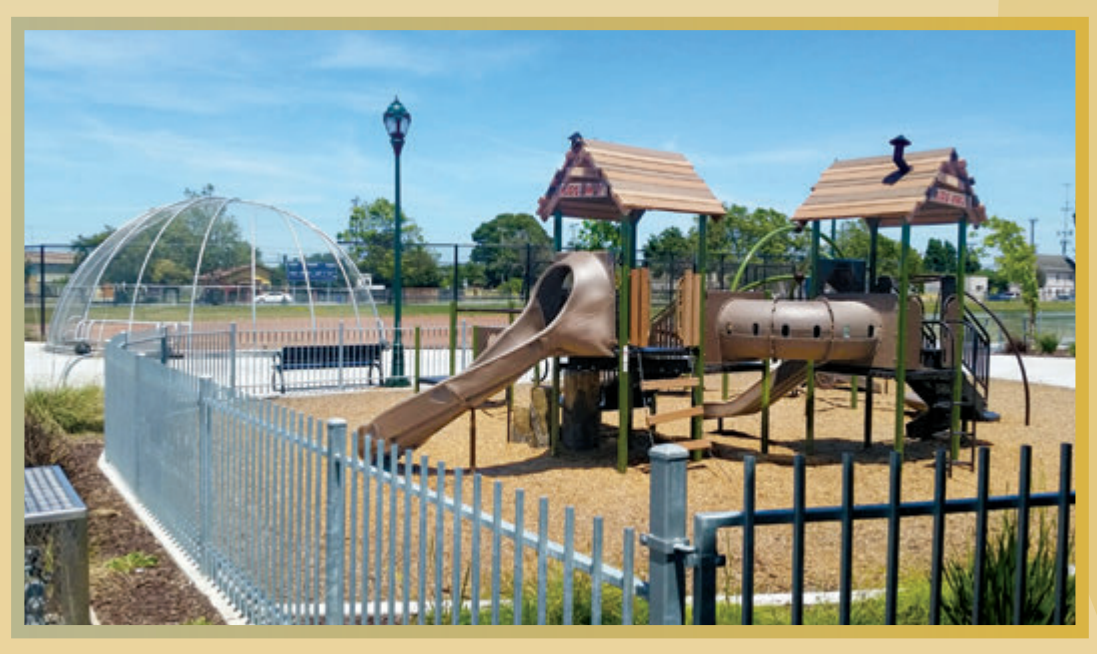
Shields-Reid Park renovation, Richmond $607,491