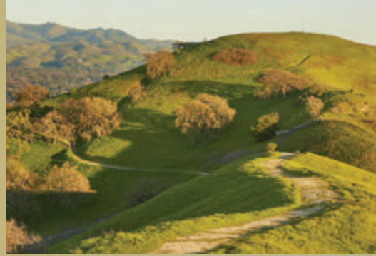
Acalanes Ridge acquisition, Lafayette $391,650