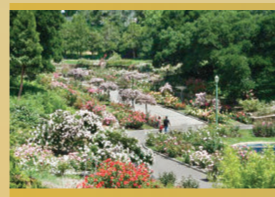
Morcom Rose Garden, Oakland $1.6 million