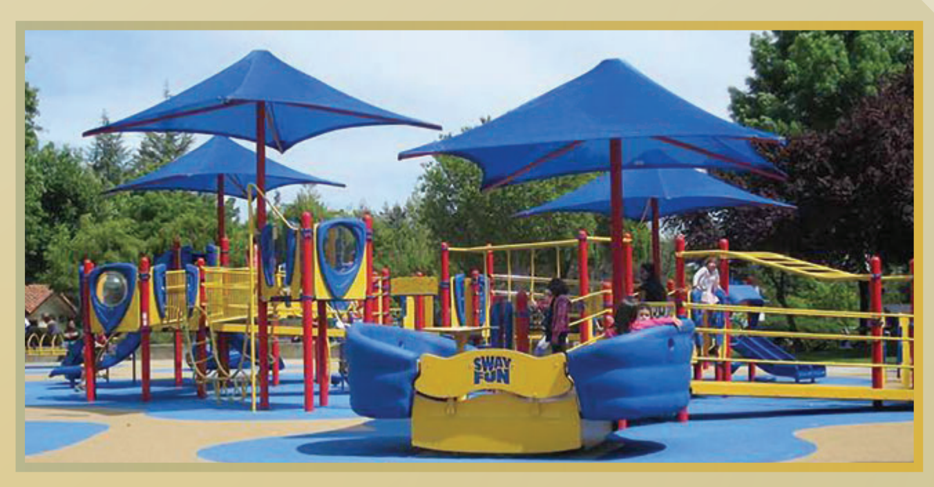
Athan Downs Playground renovation, San Ramon $305,701