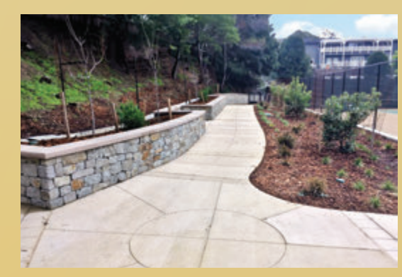
Hampton Park improvements, Piedmont $507,325