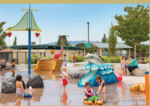
Meadow Homes Spray Park, Concord $1 million