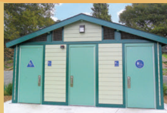
Park restrooms, Kensington $100,000