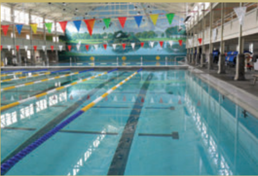
Richmond Plunge Natatorium renovation $3 million