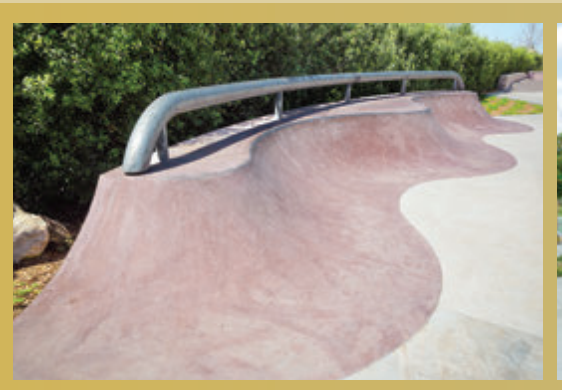
Joseph Emery Skate Spot, Emeryville $444,570