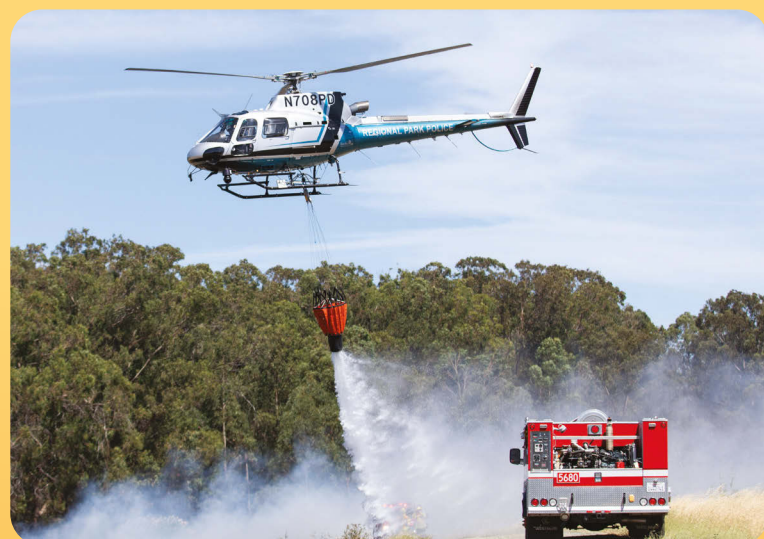
EBRPD's Eagle 7 helicopter drops water on a wildfire.