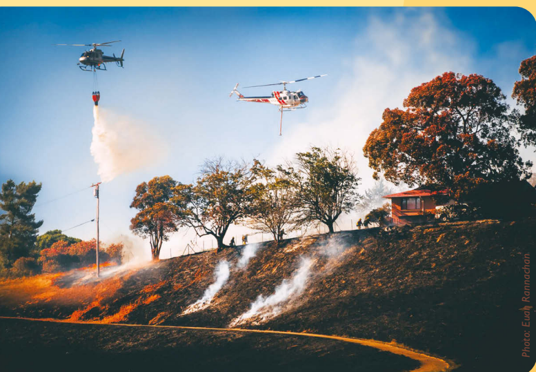
EBRPD and CAL FIRE extinguish an urban interface wildfire.