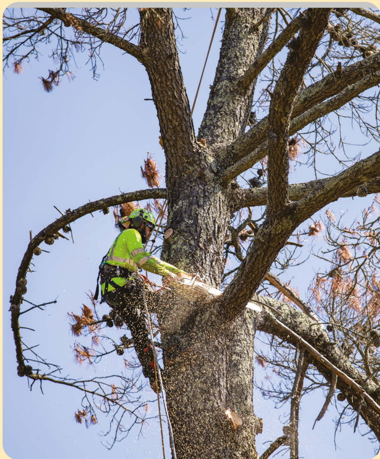
A Park District firefighter begins the removal of a dead tree.