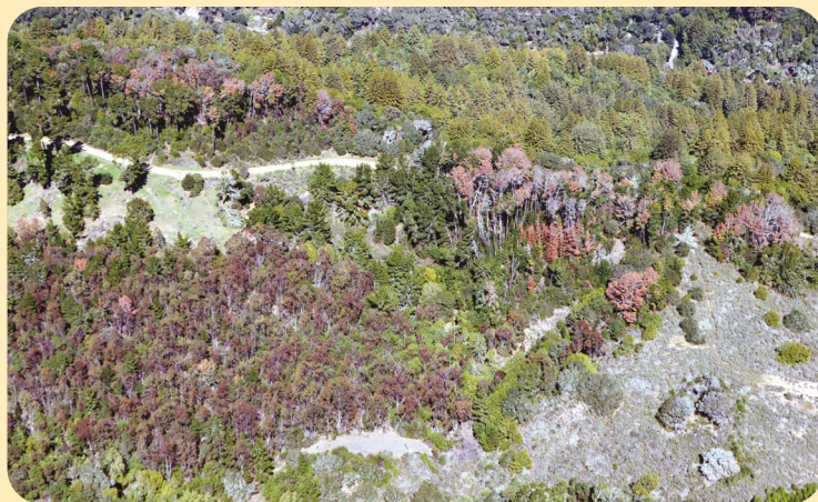
Aerial views of pine and redwood die-off.