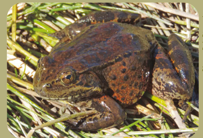
A threatened red-legged frog.