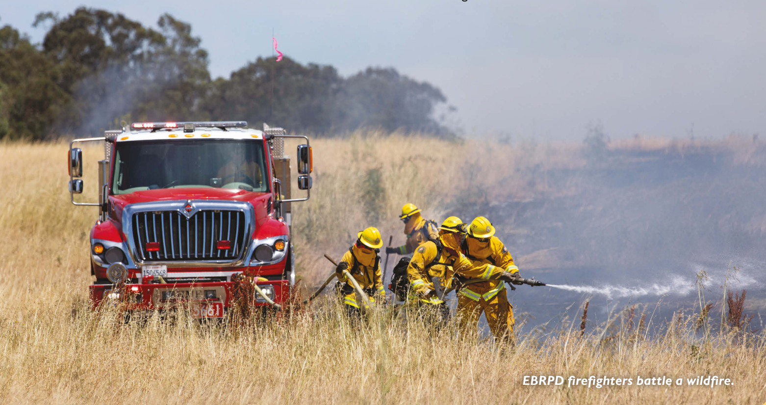
EBRPD firefighters battle a wildfire.

is uniquely situated to fight fires with wildland scale equipment and infrastructure – including helicopter water dropping capability. In 2020 alone, the District completed 223 bucket drops providing over 24,238 gallons of water to help extinguish wildfires. Continued resources are needed for fire suppression equipment, as well as mitigation.