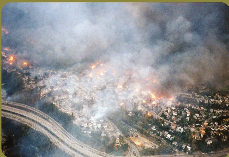
Homes burning in the 1991 Oakland Hills Firestorm.