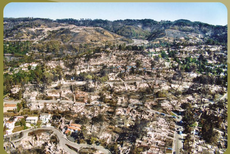
Burnt homes after the 1991 Oakland Hills Firestorm.