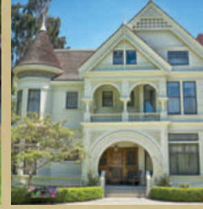
Patterson House tours