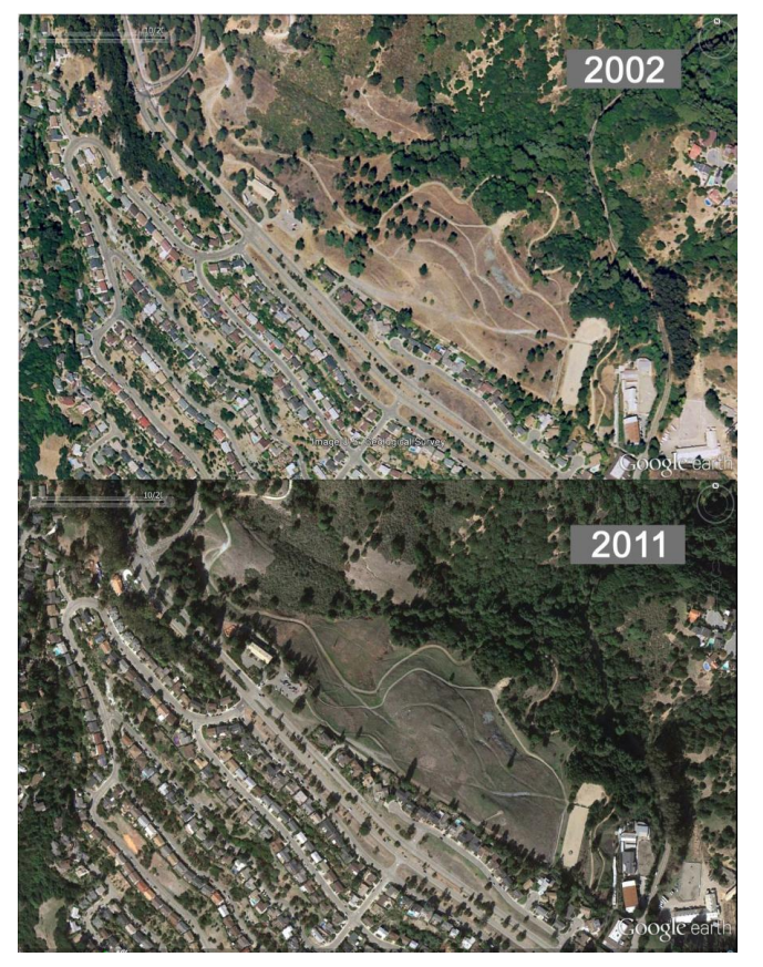
Figure 2: Note EBRPD tree removal efforts in the prairie creating new habitat for prairie flora