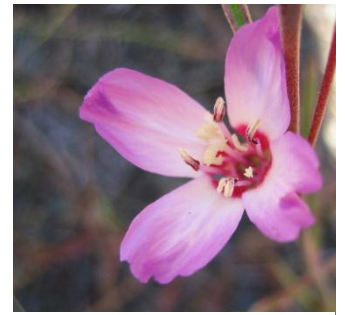
Figure 1: Clarkia franciscana in full flower

Tree removal has shown to be the most effective technique for creating more clarkia habitat. Clarkia has responded favorably in tree removal areas, increasing clarkia numbers nearly 100-fold without actively reseeding the area. The disturbance from tree and duff removal produces bare ground, which may stimulate clarkia germination. Clearing trees established on serpentine substrate is an effective restoration tool.