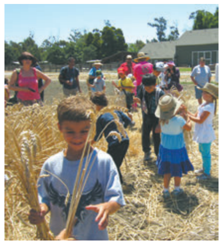
Wheat harvesting at Ardenwood.

Ardenwood Interpretive Staff Ilam-Ipm, Sun, Jul 15, 22, 29, Aug 5, 12, 26 Stop by our outdoor farm kitchen and take a tasty step back in time! Discover how to cook with a wood-burning stove and sample the special of the day, be it savory or sweet. Pick up a historic recipe to try at home.