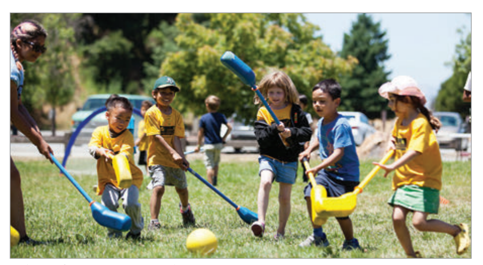
Park'n It Day Campers enjoying lawn hockey!

Ready for fun and adventure? Our eight, one-week sessions pack loads of lifeguarding skills and engaging activities. Each session has a different theme but will always cover CPR, first aid, and water rescue skills. Offered at six facilities, this day camp meets from 9am-4pm, Mon-Fri. Scholarships are available. Offered for ages 8-12. For more information on dates, themes, curriculum, and more, visit www. eblifeguard.org/juniorlifeguards. No onsite registration.