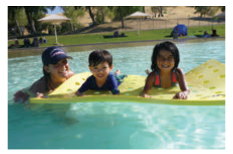
SuperTot class at Contra Loma.