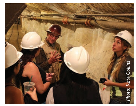
Reading patterns left by ancient tides at Hazel-Atlas Mine.

Black Diamond Interpretive Staff Various times, weekends, Mar-Nov Explore the recently extended tour route on a 1-hour, guided, small-group tour. Must be 7+ years old. Reservation tours offered at 10am (only for groups of 10-15), as well as IIam and 2pm. First-come, firstserved tours offered at noon and 3pm. Additional first-come, first-served tours may be offered, when demand is high and staffing permits. Reserve in advance online or by phone. Day-of ticket sales available