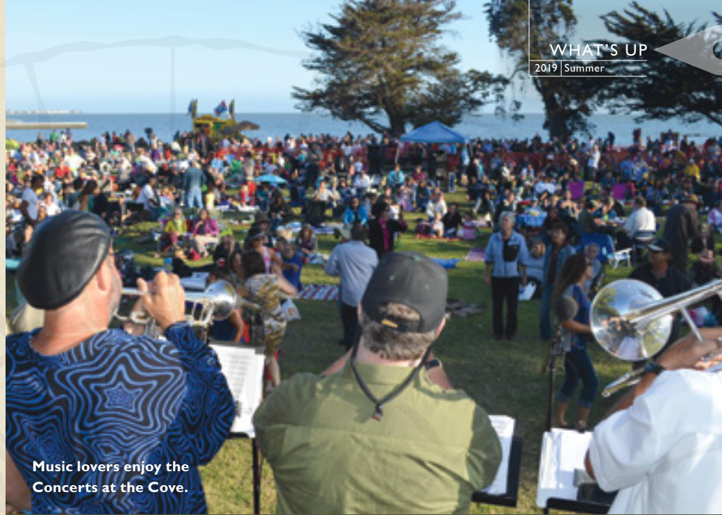
Music lovers enjoy the Concerts at the Cove.

The picnics and fireworks have filled the weekend, and it's time to help pick up the litter left behind. Bring buckets and gloves, or borrow ours. Sunday, July 7 ,