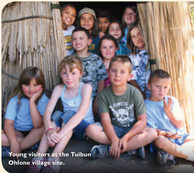
Young visitors at the Tuibun Ohlone village site.