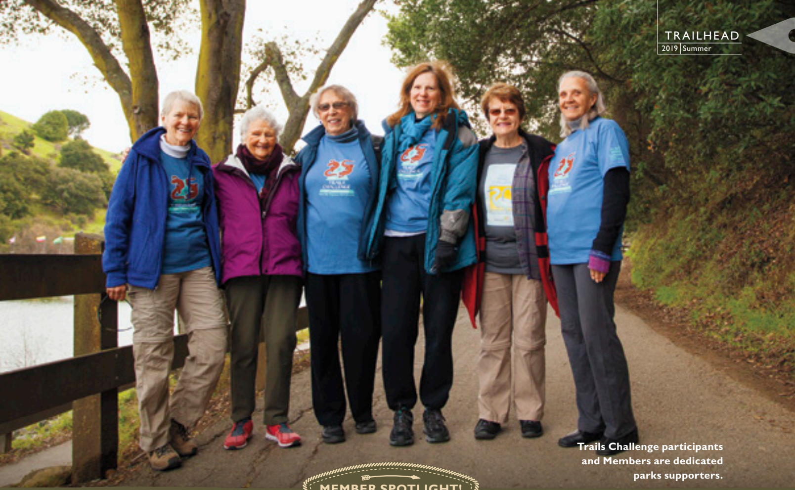
Trails Challenge participants and Members are dedicated parks supporters.