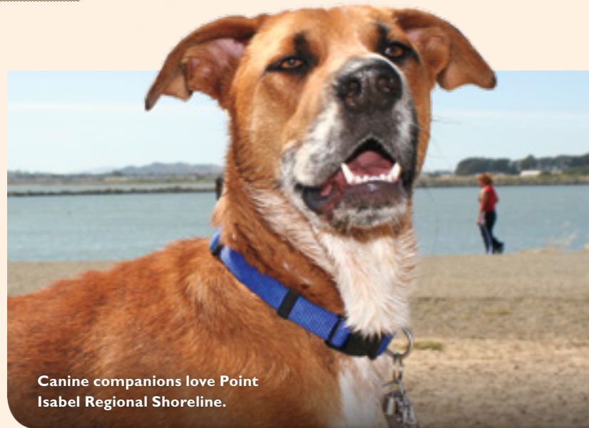
Canine companions love Point Isabel Regional Shoreline.

Often described as a "dog paradise," the 23-acre Point Isabel park in Richmond allows dogs off leash (as long as they are under the