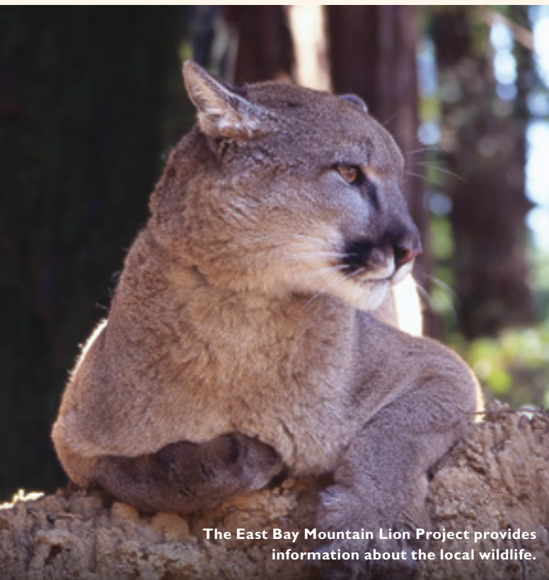
The East Bay Mountain Lion Project provides information about the local wildlife.