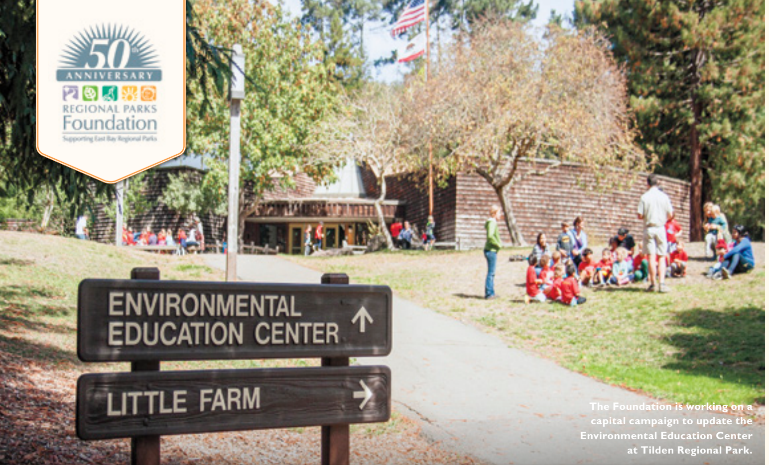
The Foundation is working on a capital campaign to update the Environmental Education Center at Tilden Regional Park.