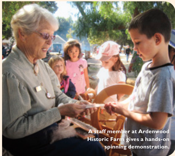
A staff member at Ardenwood Historic Farm gives a hands-on spinning demonstration.