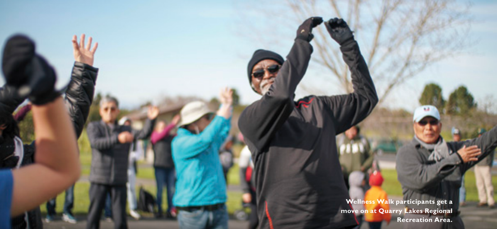
Wellness Walk participants get a move on at Quarry Lakes Regional Recreation Area.