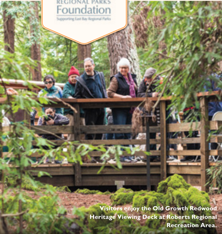
Visitors enjoy the Old Growth Redwood Heritage Viewing Deck at Roberts Regional Recreation Area.