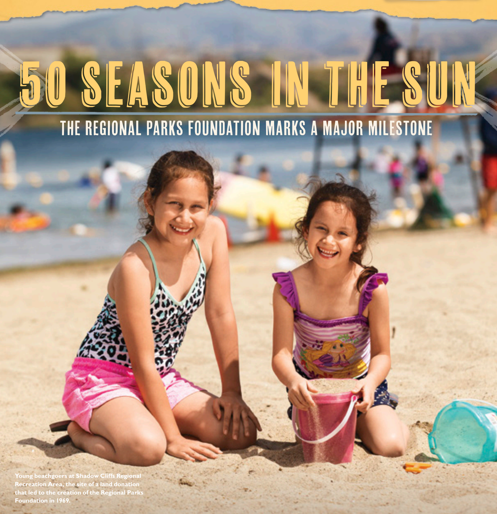
Young beachgoers at Shadow Cliffs Regional Recreation Area, the site of a land donation that led to the creation of the Regional Parks Foundation in 1969.

THE REGIONAL PARKS FOUNDATION MARKS A MAJOR MILESTONE