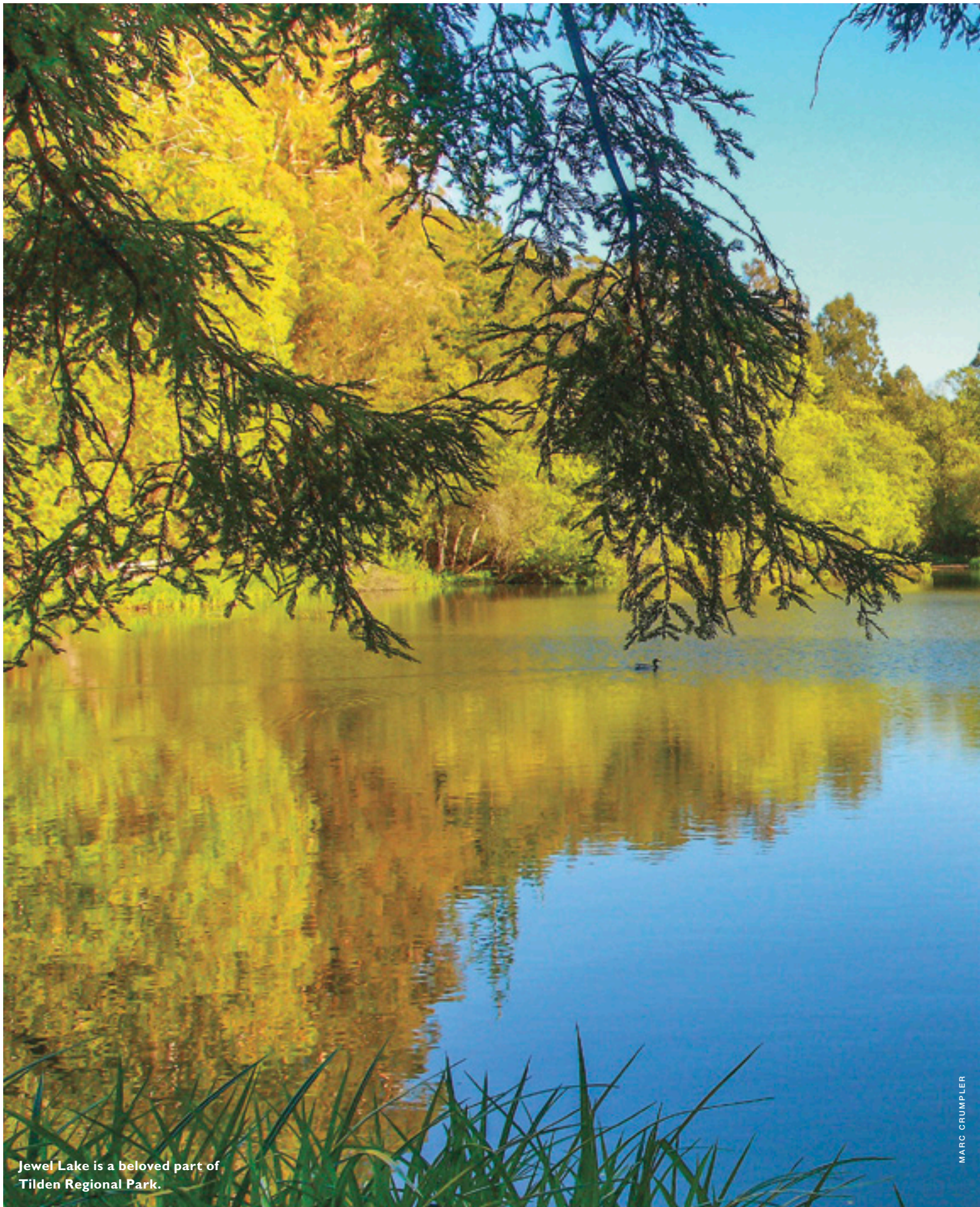
Jewel Lake is a beloved part of Tilden Regional Park.