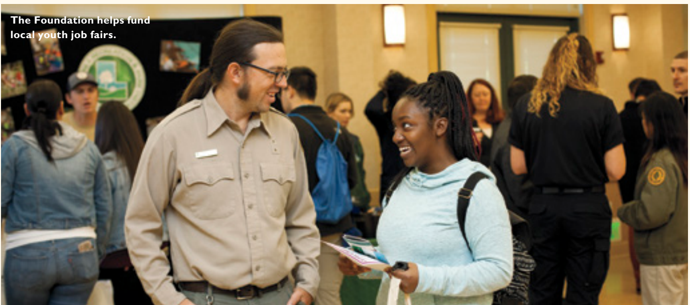
The Foundation helps fund local youth job fairs.