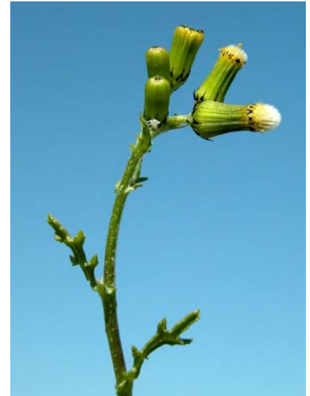
Common Groundsel Senecio vulgaris Introduced Annual Sunflower Family