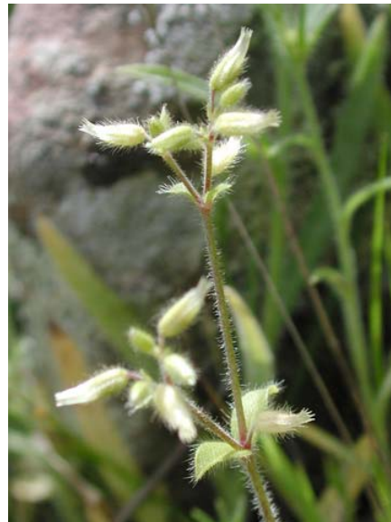
Mouse-ear Chickweed Cerastium glomeratum Introduced Annual Pink Family