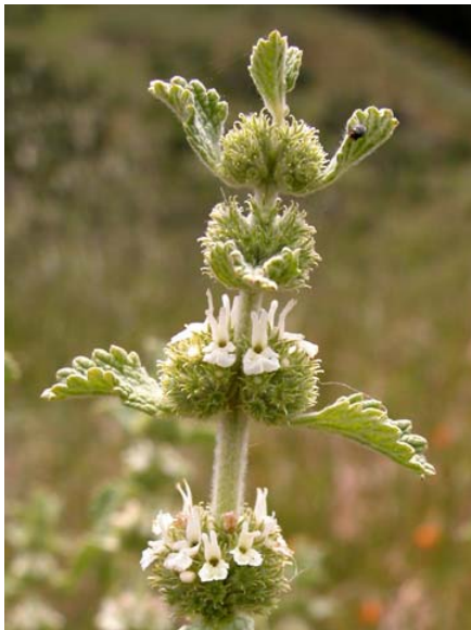
Common Horehound Marrubium vulgare Introduced Perennial Mint Family