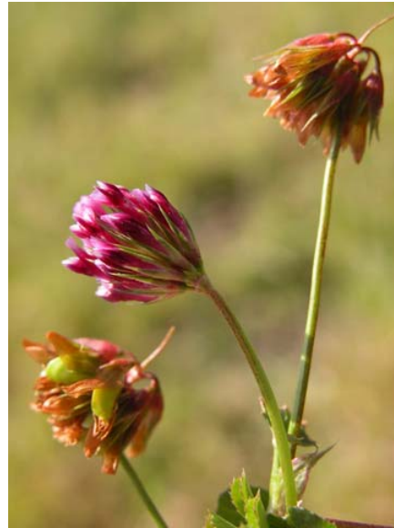
Pinpoint Clover Trifolium gracilentum var. gracilentum Native Annual Pea Family