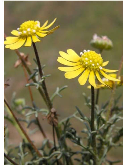
Glue-seed Blennosperma nanum var. nanum Native Annual Sunflower Family