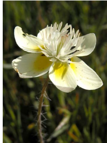
Cream Cups Platystemon californicus Native Annual Poppy Family