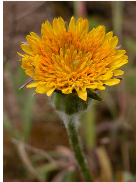
Large-flower Native Dandelion Agoseris grandiflora Native Perennial Sunflower Family