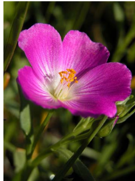
Magenta Red Maids Calandrinia ciliata Native Annual Purslane Family