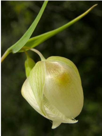
White Fairy Lantern Calochortus albus Native Perennial Lily Family