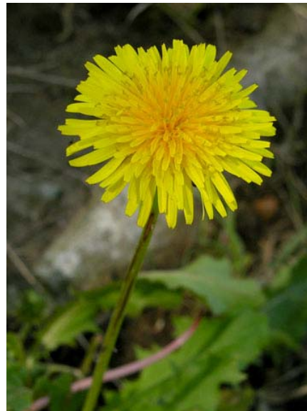
Common Dandelion Taraxacum officinale Introduced Biennial-Perennial Sunflower Family