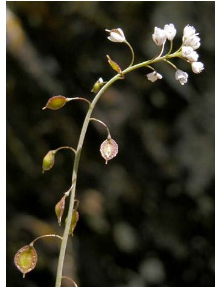
Hairy Fringe-pod Thysanocarpus curvipes Native Annual Mustard Family