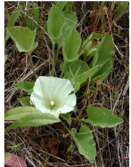
Shortstem Morning Glory Calystegia subacaulis ssp. subacaulis Native Perennial Morning-Glory Family