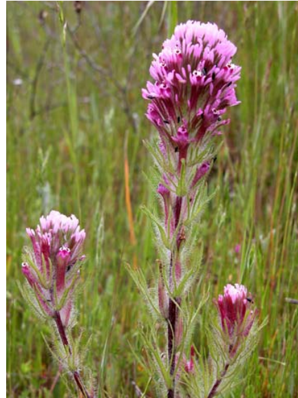
Purple Owl's Clover Castilleja exserta ssp. exserta Native Annual Snapdragon Family