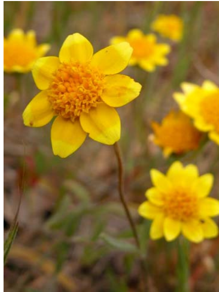
Goldfields Lasthenia californica Native Annual Sunflower Family