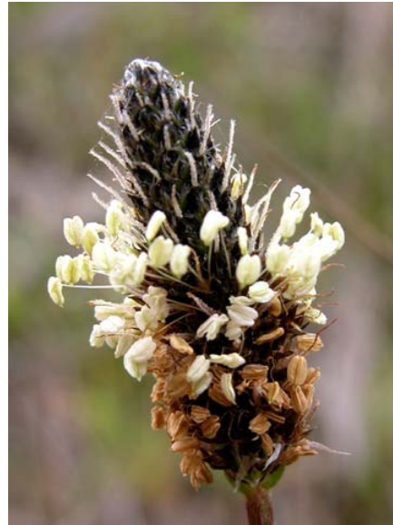
English Plantain Plantago lanceolata Introduced Annual Plantain Family