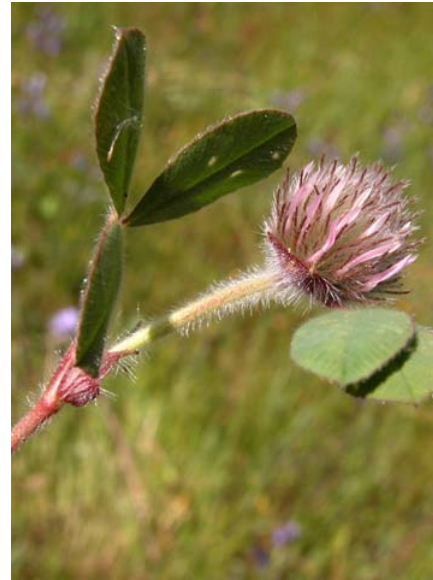
Rose Clover Trifolium hirtum Introduced Annual Pea Family