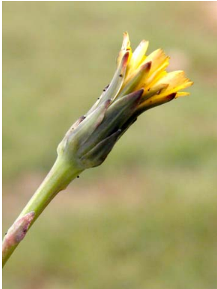
Smooth Cat's-ear Hypochaeris glabra Introduced Annual Sunflower Family