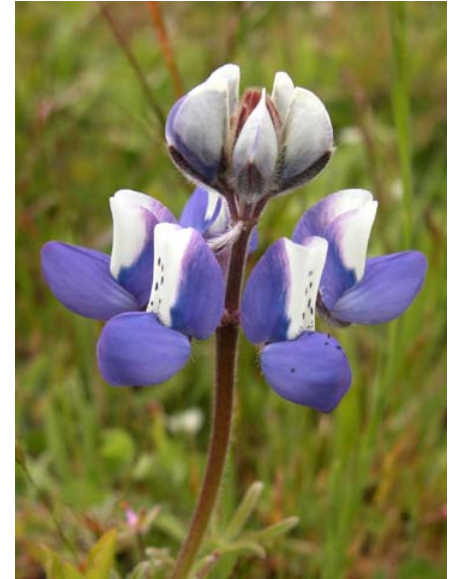
Douglas Sky Lupine Lupinus nanus Native Annual Pea Family