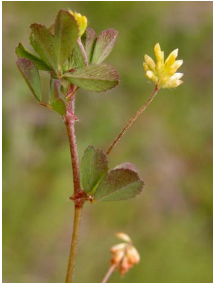
Shamrock Clover Trifolium dubium Introduced Annual Pea Family