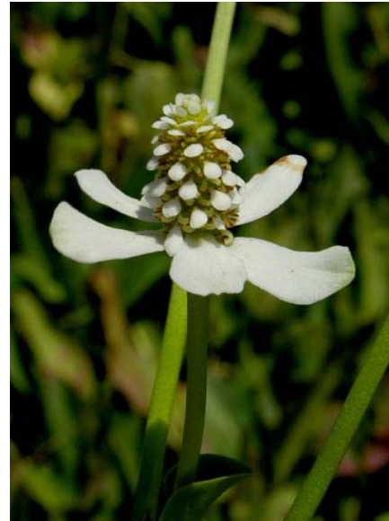
Yerba Mansa Anemopsis californica Native Perennial Lizard's-Tail Family