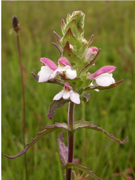
Bellardia Bellardia trixago Introduced Annual Snapdragon Family