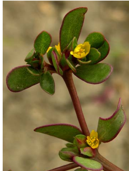
Common Purslane Portulaca oleracea Introduced Perennial Purslane Family