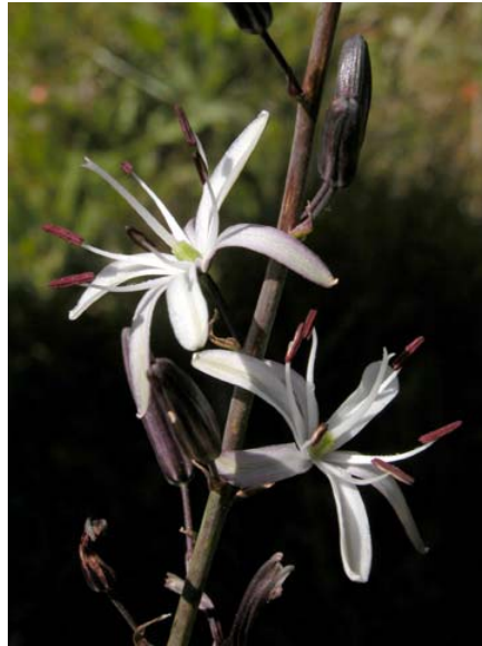
Common Soap Plant Chlorogalum pomeridianum var. pomeridianum Native Perennial Lily Family