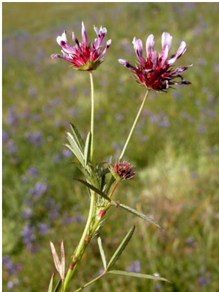
Tomcat Clover Trifolium willdenovii Native Annual Pea Family