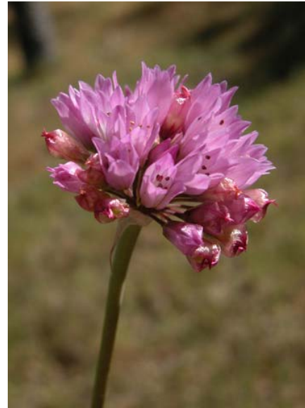
Pink / Serrated Onion Allium serra Native Perennial Lily Family