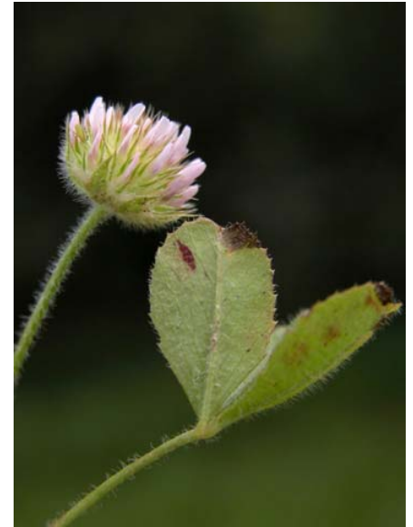
Small-head Clover Trifolium microcephalum Native Annual Pea Family