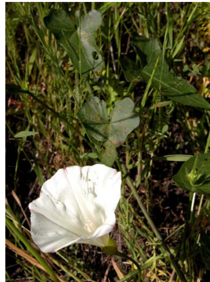
Climbing Morning Glory Calystegia purpurata ssp. purpurata Native Perennial Morning-Glory Family