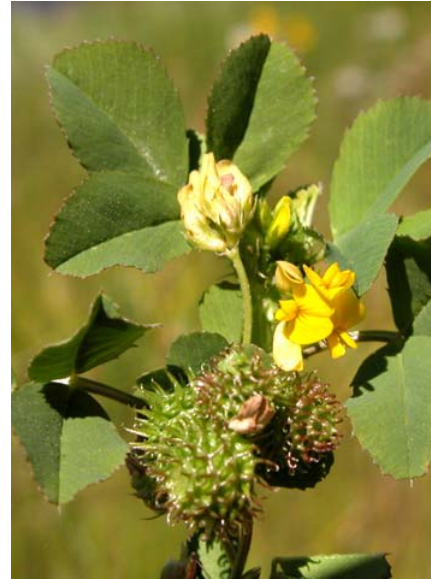
California Bur Clover Medicago polymorpha Introduced Annual Pea Family