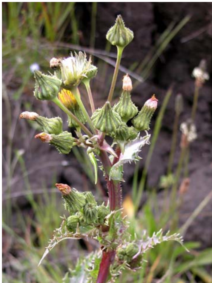
Prickly Sow Thistle Sonchus asper ssp. asper Introduced Annual Sunflower Family