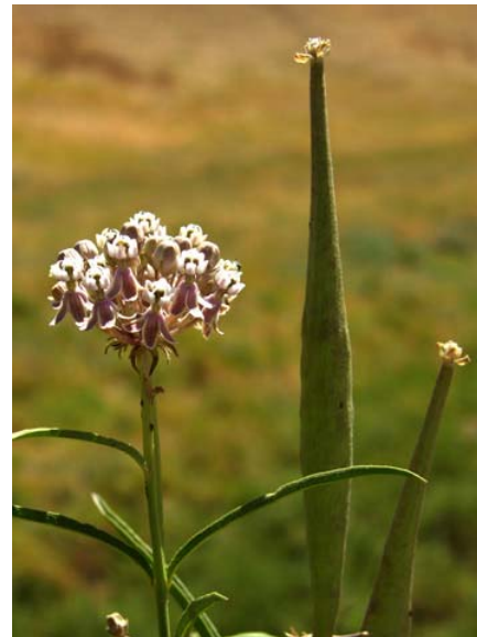
Whorled/Narrow-leaf Milkweed Asclepias fascicularis Native Perennial Milkweed Family