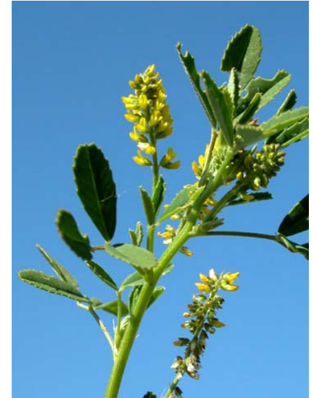
Sour Clover Melilotus indica Introduced Annual-Biennial Pea Family