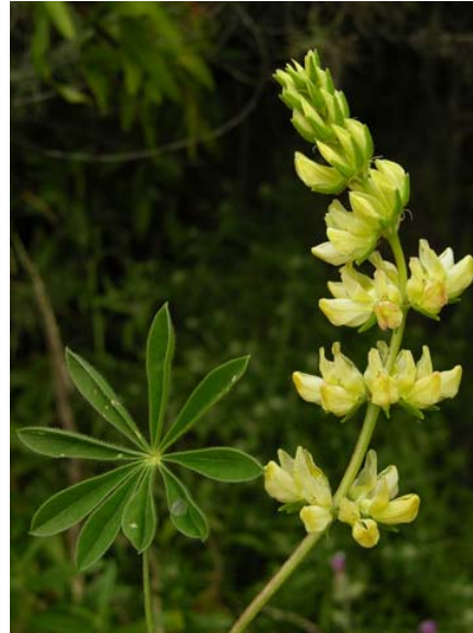
Gully Lupine Lupinus microcarpus var. densiflorus Native Annual Pea Family