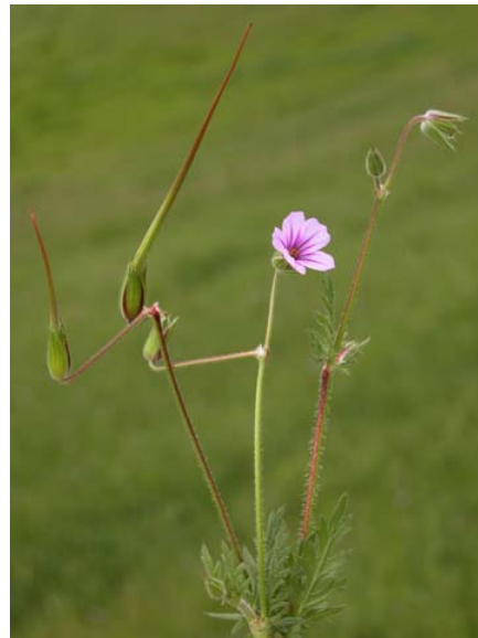
Long-beaked Filaree Erodium botrys Introduced Annual Geranium Family