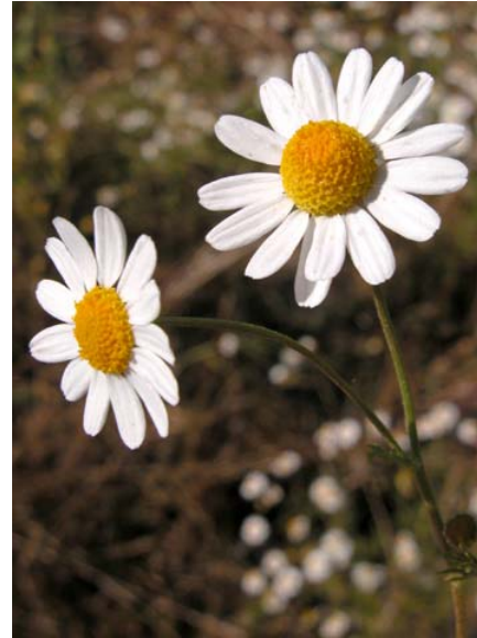
Mayweed Anthemis cotula Introduced Annual Sunflower Family