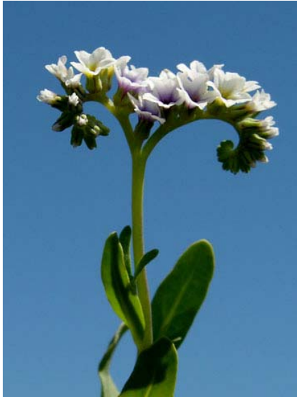
Seaside Heliotrope Heliotropium curassavicum Native Perennial Borage Family