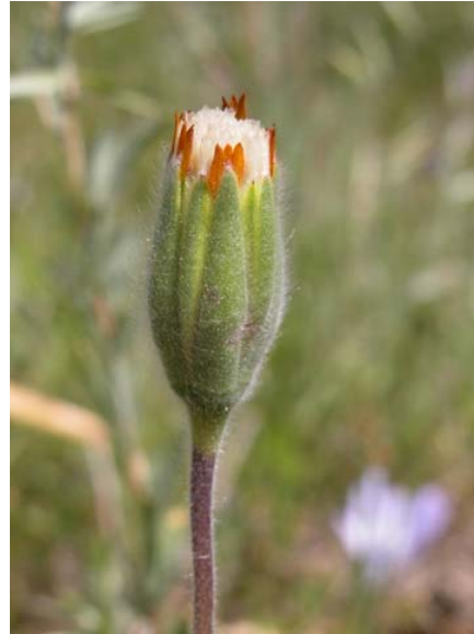
Blow Wives Achyrochaena mollis Native Annual Sunflower Family