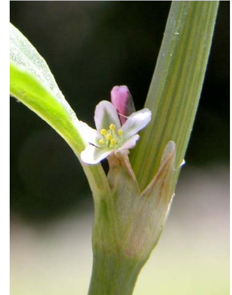
Common Yard Knotweed Polygonum arenastrum Introduced Annual Buckwheat Family