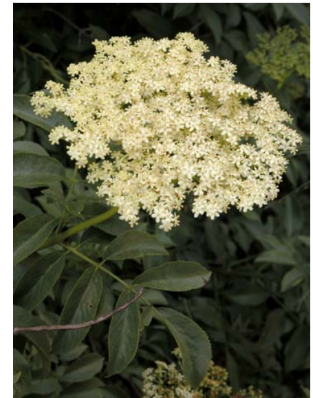
Blue Elderberry Sambucus mexicana Native Perennial Honeysuckle Family