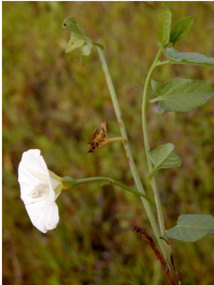
Field Bindweed Convolvulus arvensis Introduced Perennial Morning-Glory Family