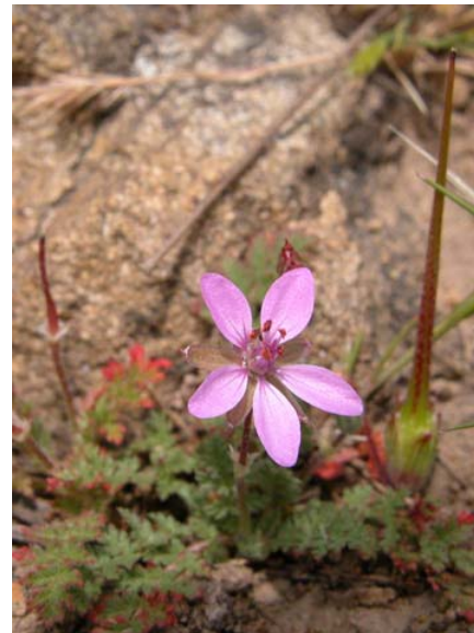
Red-stem Filaree Erodium cicutarium Introduced Annual Geranium Family