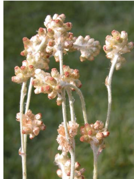
Weedy Cudweed Gnaphalium luteo-album Introduced Annual Sunflower Family