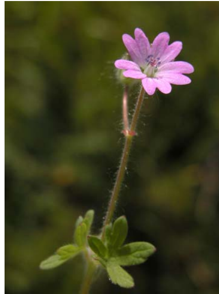
Hairy Dove's Foot Geranium Geranium molle Introduced Annual Geranium Family