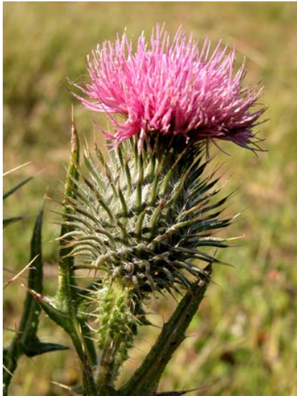
Bull Thistle Cirsium vulgare Introduced Biennial Sunflower Family