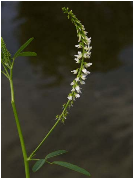
White Sweet Clover Melilotus alba Introduced Annual-Biennial Pea Family