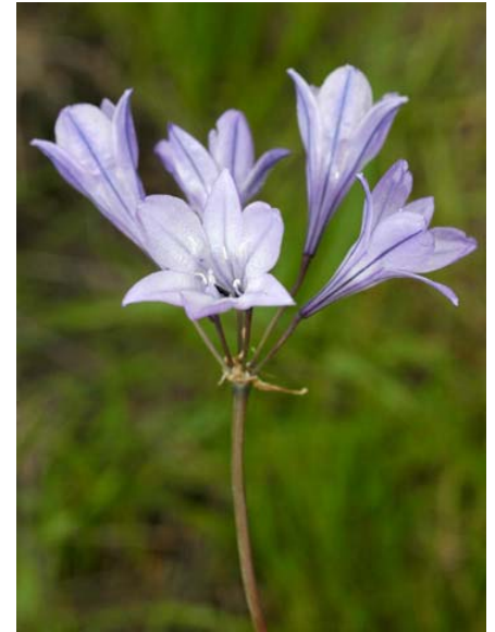
Ithuriel's Spear Triteleia laxa Native Perennial Lily Family