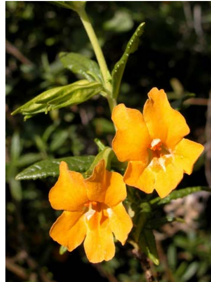
Bush Monkey Flower Mimulus aurantiacus Native Perennial Snapdragon Family