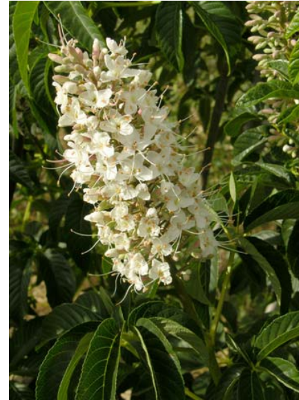
California Buckeye Aesculus californica Native Perennial Buckeye Family