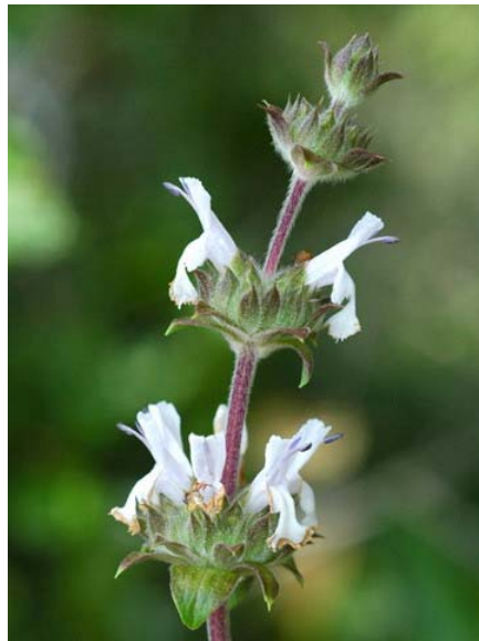
Black Sage Salvia mellifera Native Perennial Mint Family