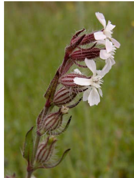
Windmill Pink Silene gallica Introduced Annual Pink Family