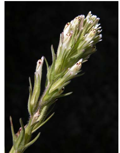
Valley Tassels Castilleja attenuata Native Annual Snapdragon Family