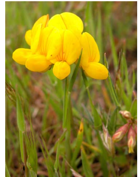
Bird's-foot Deerweed Lotus corniculatus Introduced Perennial Pea Family