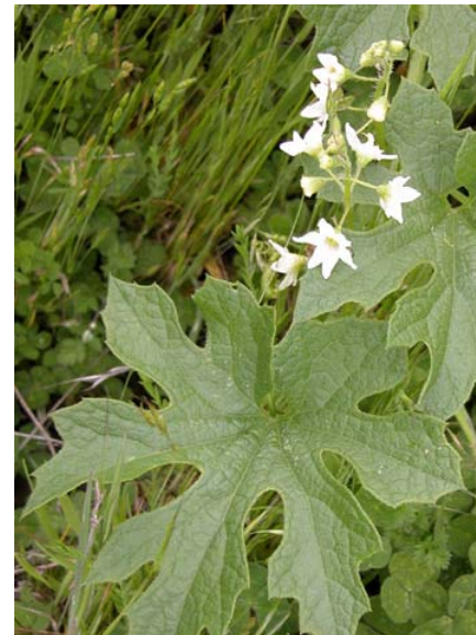
Oregon / Coast Manroot Marah oreganus Native Perennial Gourd Family