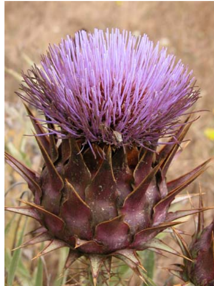
Cardoon / Artichoke Thistle Cynara cardunculus Introduced Perennial Sunflower Family