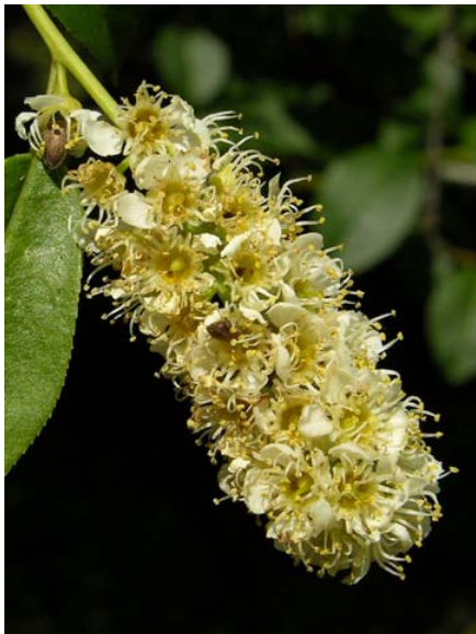
Western Chokecherry Prunus virginiana var. demissa Native Perennial Rose Family