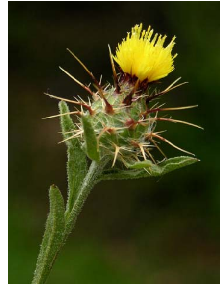
Tocalote Centaurea melitensis Introduced Annual Sunflower Family