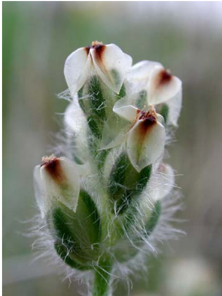
California Dwarf Plantain Plantago erecta Native Annual Plantain Family