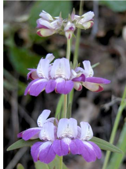
Chinese Houses Collinsia heterophylla Native Annual Snapdragon Family