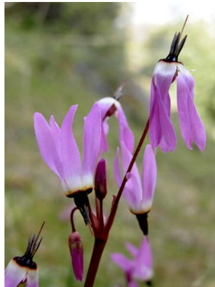
Mosquitobills Shooting Star Dodecatheon hendersonii Native Perennial Primrose Family