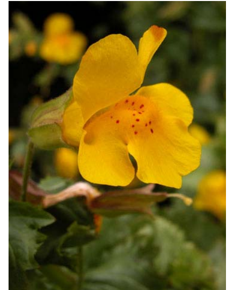
Golden Monkey Flower Mimulus guttatus Native Perennial Snapdragon Family