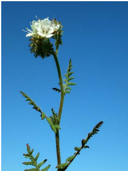
Wild Heliotrope Phacelia Phacelia distans Native Annual Waterleaf Family