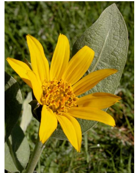
Gray Mule's Ear Wyethia helenioides Native Perennial Sunflower Family