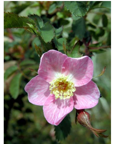
California Wild Rose Rosa californica Native Perennial Rose Family