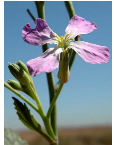
Wild Radish Raphanus sativus Introduced Annual Mustard Family