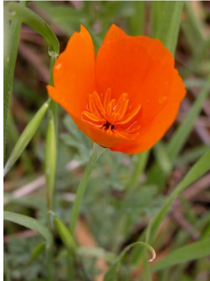
California Poppy Eschscholzia californica Native Perennial Poppy Family