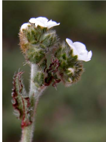
Nievitas Popcorn Flower Plagiobothrys nothofulvus Native Annual Borage Family