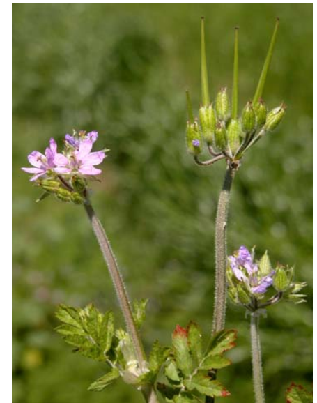
White-stem Filaree Erodium moschatum Introduced Annual Geranium Family