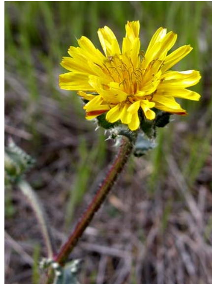
Bristly Ox-tongue Picris echioides Introduced Annual-Biennial Sunflower Family