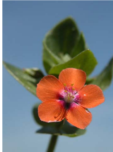
Scarlet Pimpernel Anagallis arvensis Introduced Annual Primrose Family