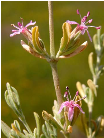
Alkali Heath Frankenia salina Native Perennial Frankenia Family