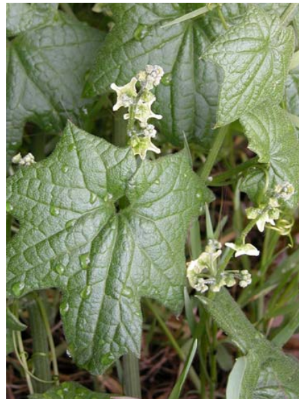
Common / California Manroot Marah fabaceus Native Perennial Gourd Family