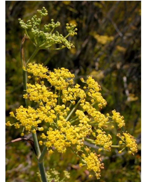
Sweet Fennel Foeniculum vulgare Introduced Perennial Carrot Family