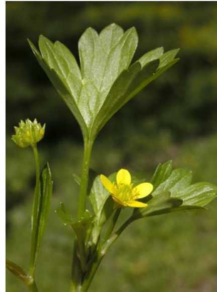
Prickleseed Buttercup Ranunculus muricatus Introduced Annual Buttercup Family