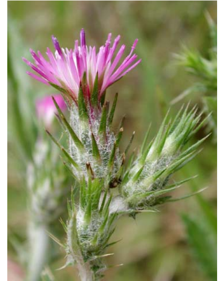
Italian Thistle Carduus pycnocephalus Introduced Annual Sunflower Family