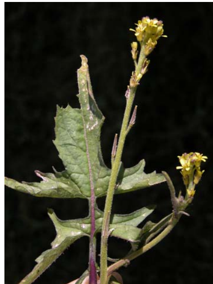
Black Mustard Brassica nigra Introduced Annual Mustard Family