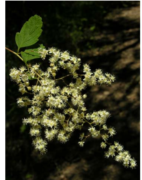
Creambush / Ocean Spray Holodiscus discolor Native Perennial Rose Family