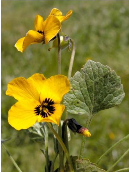
Johnny-Jump-Up / Wild Pansy Viola pedunculata Native Perennial Violet Family