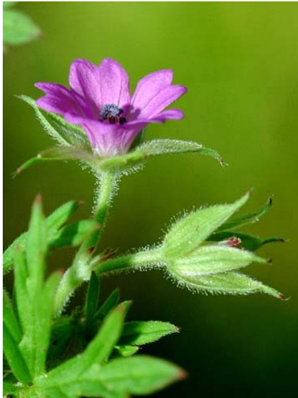
Purpletip Cut-leaf Geranium Geranium dissectum Introduced Annual Geranium Family