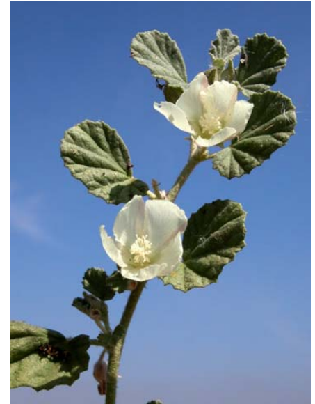
Alkali Mallow Malvella leprosa Native Perennial Mallow Family