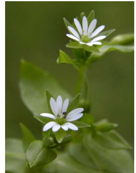
Common Chickweed Stellaria media Introduced Annual Pink Family