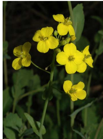
Yellow Field Mustard Brassica rapa Introduced Annual Mustard Family