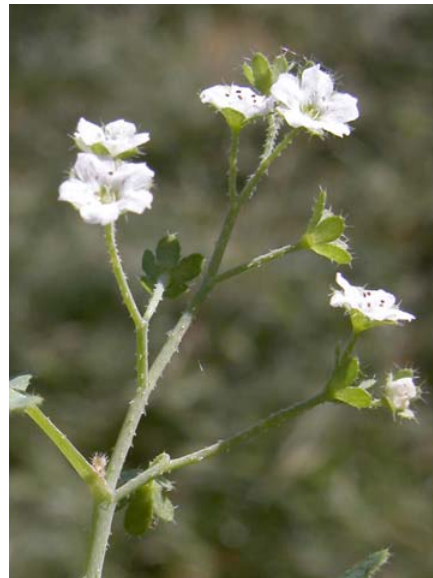
White Fiesta Flower Pholistoma membranaceum Native Annual Waterleaf Family