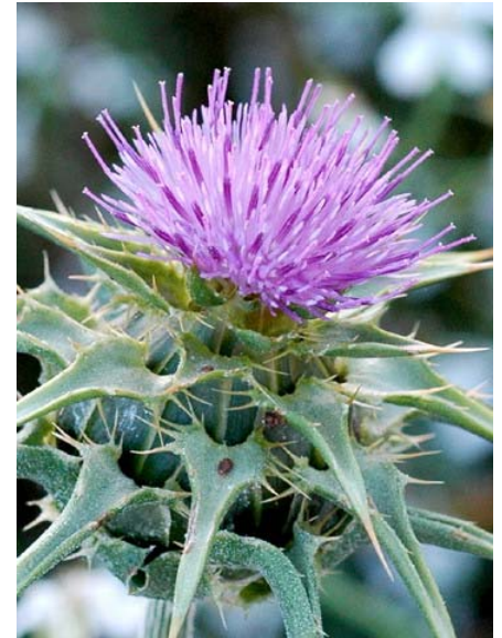
Milk Thistle Silybum marianum Introduced Annual-Biennial Sunflower Family