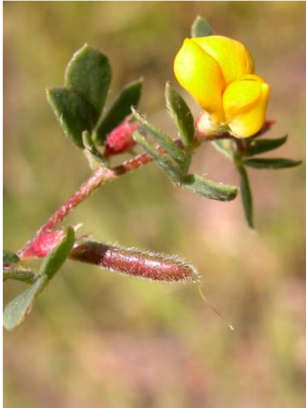
California Lotus Lotus wrangelianus Native Annual Pea Family