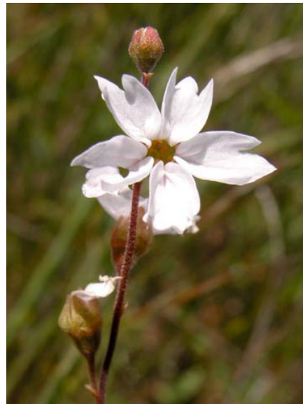
Woodland Star Lithophragma affine Native Perennial Saxifrage Family