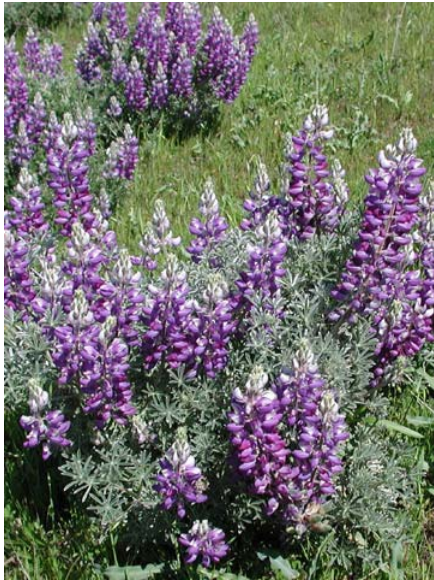
Blue Bush / Silver Lupine Lupinus albifrons var. albifrons Native Perennial Pea Family