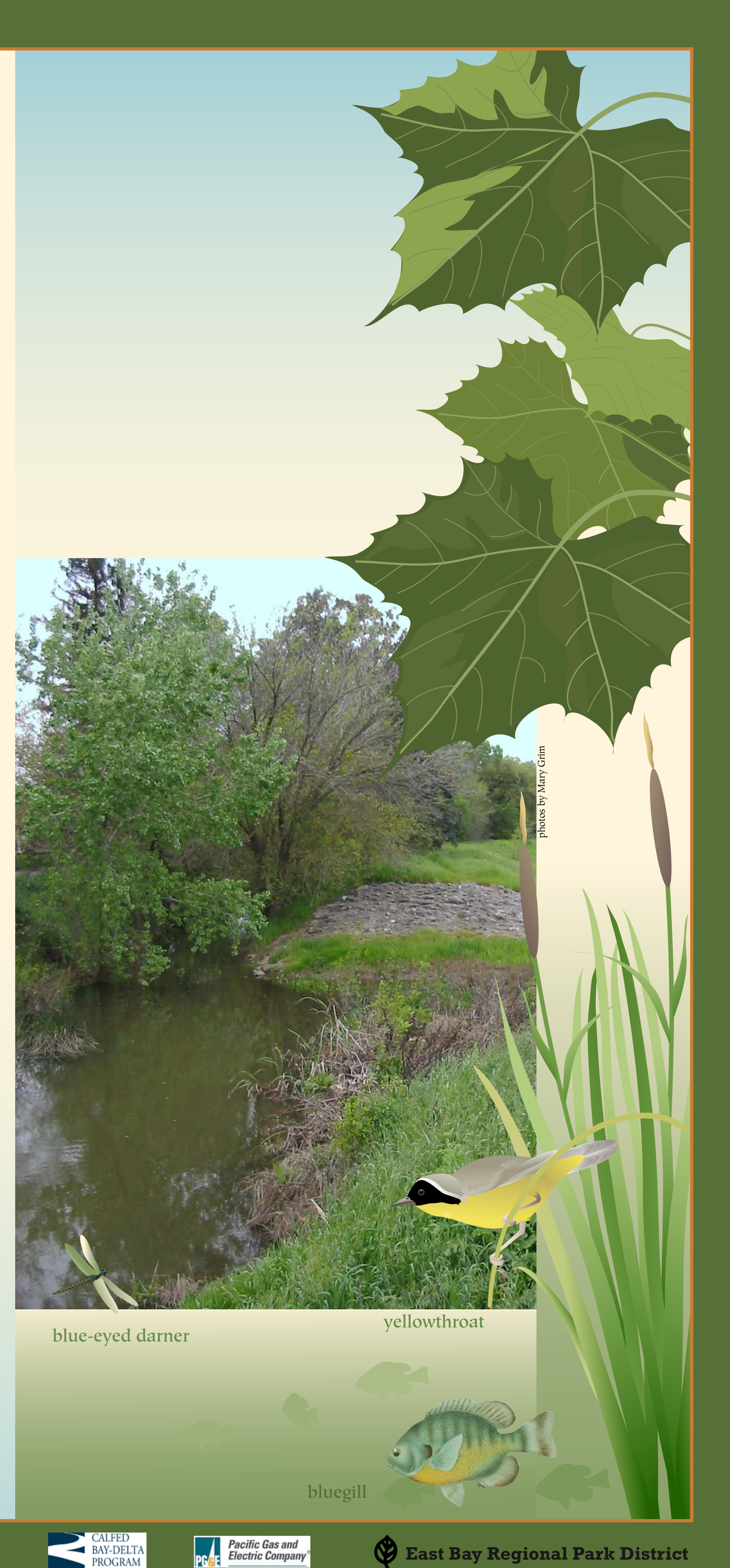
Corridor restored for multiple uses