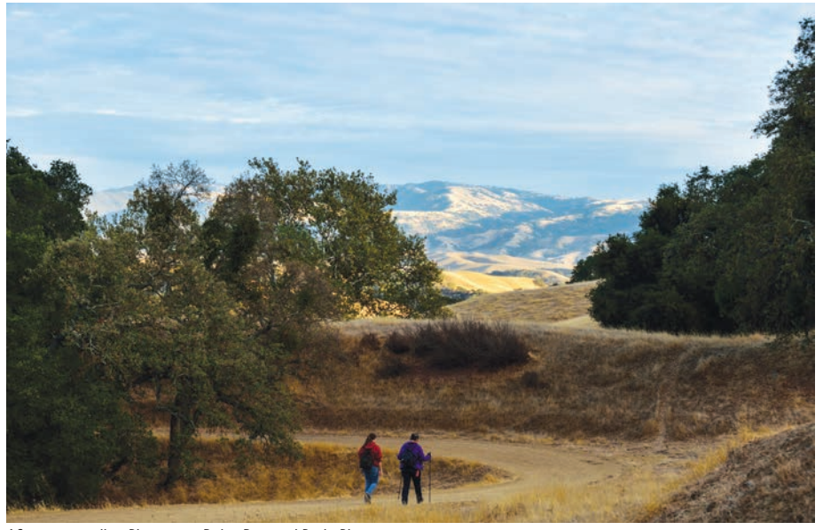
Afternoon stroll at Pleasanton Ridge Regional Park, Pleasanton.