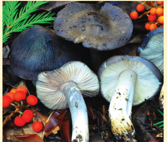
The midnight-blue entoloma (Entoloma medianox), a Bay Area mushroom recently described to science by author Christian Schwarz.

'Tis the season for slimy critters! We'll walk up to High Valley Pond to look for mating California newts, and learn about other amphibians who also live in the park.