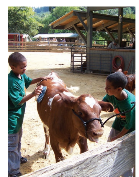
Learning to care for animals at Tilden Nature Area.