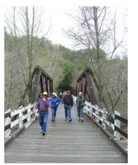
Wednesday Walk at Sunol Regional Wilderness, along Camp Ohlone Road, Sunol.