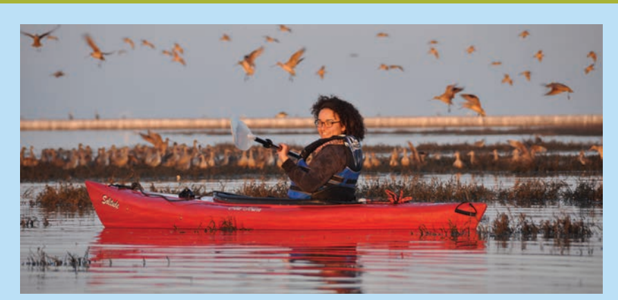
Sunrise kayaking with shorebirds at Crown Memorial State Beach.