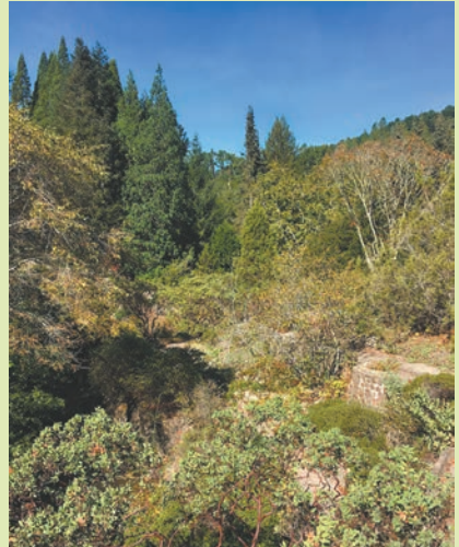
A view of the Botanic Garden

Sunday, Feb II, 2-3pm. Free. Please join us at the East Bay Regional Parks Botanic Garden for a special family-friendly Sensory Tour. You'll explore the garden with your hands, nose, ears, and eyes. Smell the sages, feel soft hazel leaves, look for crayfish in Wildcat Creek and newts in the pond on this docent-led, family-friendly tour. Meet