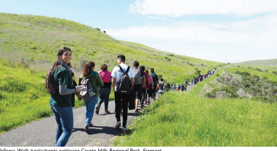
Wellness Walk participants exploring Coyote Hills Regional Park, Fremont.