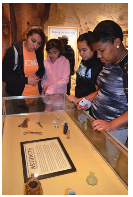
School children viewing artifacts from the 1800s and early 1900s

I-4pm, Sun, Jan 14 Examine historic mining equipment and learn why some of the miners' most important tools were also their most dangerous. Wheelchair accessible.