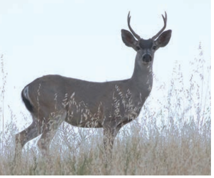
Black-tailed deer at Del Valle Regional Park.

All programs meet at the Del Valle Rocky Ridge Visitor Center unless otherwise noted. The Rocky Ridge Visitor Center is open on Saturdays and Sundays 10am-5pm. ALONG THE WATER'S EDGE SP HPHP Del Valle Interpretive Staff 9:30am-12:30pm, Mon, Jan I Welcome the New Year with this 3-mile walk along the lake. Contemplate what the