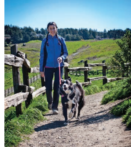
Walking with best friend at Redwood Regional Park, Oakland.