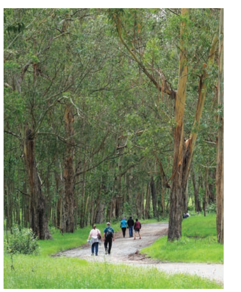
Enjoying a walk in the eucalyptus grove at Point Pinole Regional Shoreline, Richmond.