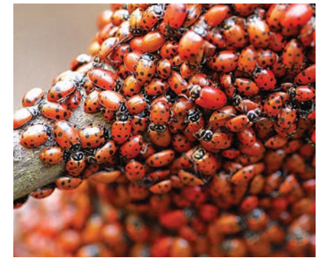
Ladybugs at Redwood Regional Park. Thousands of ladybugs might collect in the same area year after year.

10-11:30am, Sun, Feb 11 Look for the fig tree and amorous newts that inhabit this hidden gem of a park in the Hayward Hills. Heavy rain cancels. 12+yrs.