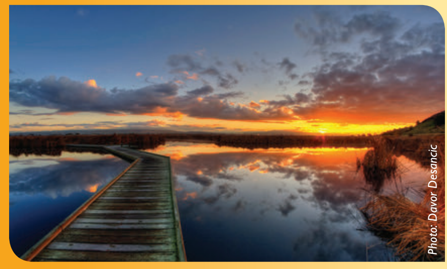
The breaking of dawn paints the sky's perfect reflection on still water at Coyote Hills.

Monthly activities and outings that provide safe, low-impact physical activity and improve health and well-being of all Bay Area residents, through regular use and enjoyment of the Regional Parks. Look for HPHP.