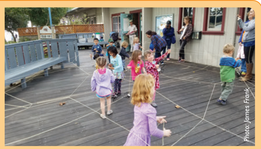
"Sea Squirts" at Crab Cove using their senses to feel what it's like to be a spider.