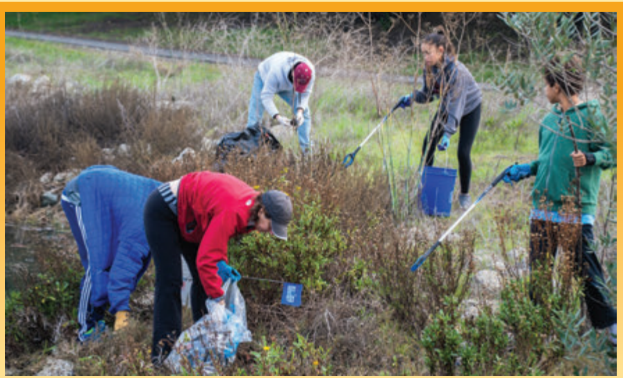
Volunteers help restore Dr. Martin Luther King Jr. Memorial Grove and the marshes by clearing up and removing invasive plants.