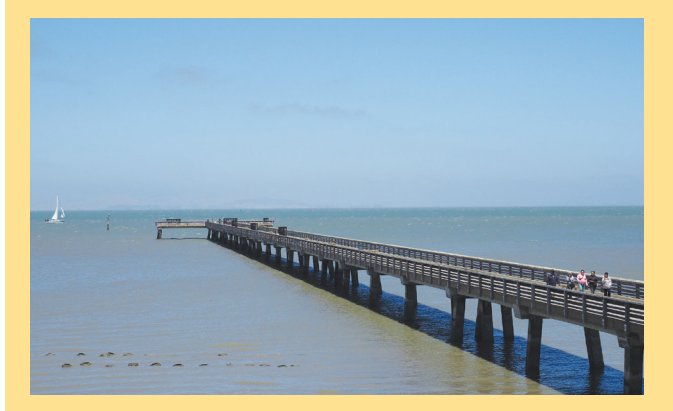
The fishing pier is about 0.6 miles from the Atlas Bridge parking lot. The old pier had a single railroad track on it for loading barges bound for freighters sailing to the Philippines, Central and South America, and Alaska. You can still see the old pilings.

Year opened: 1973 Acres: 2.432 Highlights: Hiking, biking, birding, fishing, camping, picnicking, volleyball, horseshoes, childen's play area.