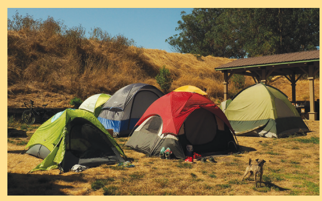
A sheltered group campsite near the pier provides a convenient and accessible getaway