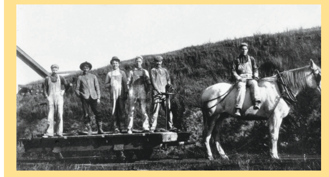
For nearly 80 years, this once-isolated peninsula was home to a series of "powder" companies that manufactured explosives used to help build the West.

The park includes several picnic areas, a shuttle service to access the fishing pier, a group campsite, a climbing structure for children, and a volleyball area. In 2017, the East Bay Regional Park District completed major marshland restoration and public access enhancements: