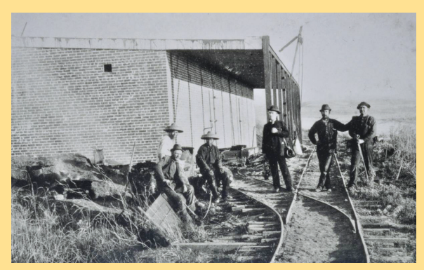
The workers at Giant Powder included many ethnic groups: Portuguese, Italian, Slavic, Chinese, Anglo-Irish, Scottish, Scandinavian, and German

Following California statehood in 1850, Point Pinole was the site of Chinese and Croatian fishing villages and small, Americanowned ranches and farms. From 1881 to 1960, the point was the site of four dynamite companies, including the Giant Powder Company, which added "Giant" to local place names. In 1963, Bethehem Steel bought the land and later sold it to the Park District, which opened the park to the public in 1973.