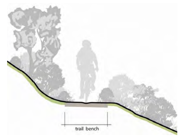
Figure 2.1 – Trail Cross Section

Defining what constitutes a narrow natural surface trail is not a uniform concept. As Table 2.1- Agency Definition of Narrow Trails illustrates, there is a wide variation in the definition of "narrow trail" among the San Francisco Bay Area agencies surveyed. Several San Francisco Bay Area park and open space managers define narrow trails as roughly four to six feet wide; however, some agencies manage narrower trails. For purpose of this study, narrow trails are assumed to be six inches up to six feet wide.