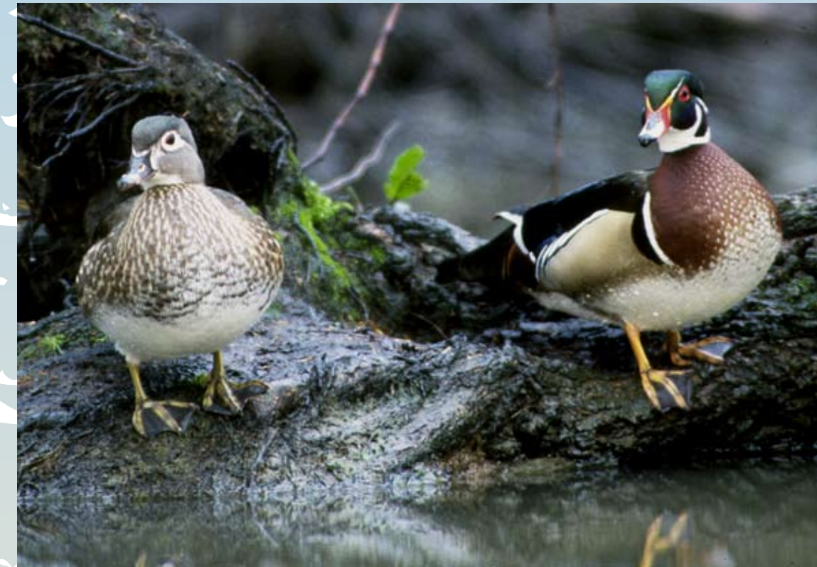
Female and male wood ducks

The tree planting in this area is designed to mimic the forested flood plain of historic Alameda Creek. In the last century, more than 95% of this type of riparian habitat has disappeared. Riparian habitats are productive bird and wildlife breeding and wintering grounds. They are important migratory stops and corridors for birds and other wildlife. By helping to control floods, filter and clean water, and recharge ground water supplies, forested riparian areas improve our quality of life. The wood duck is a colorful, feathered-jewel that lives and nests in riparian areas. Its population is on the decline locally due to the loss of this type of habitat.