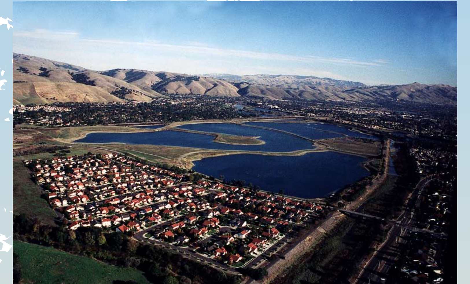
Aerial view of Quarry Lakes looking Southeast