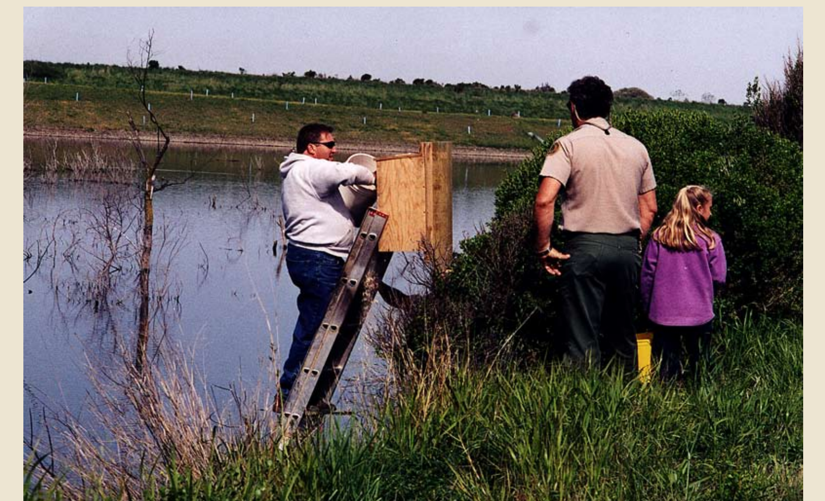
Placing wood duck nesting boxes at Quarry Lakes

Sponsored by the East Bay Regional Park District, Alameda County Water District, and the California Wood Duck Program.