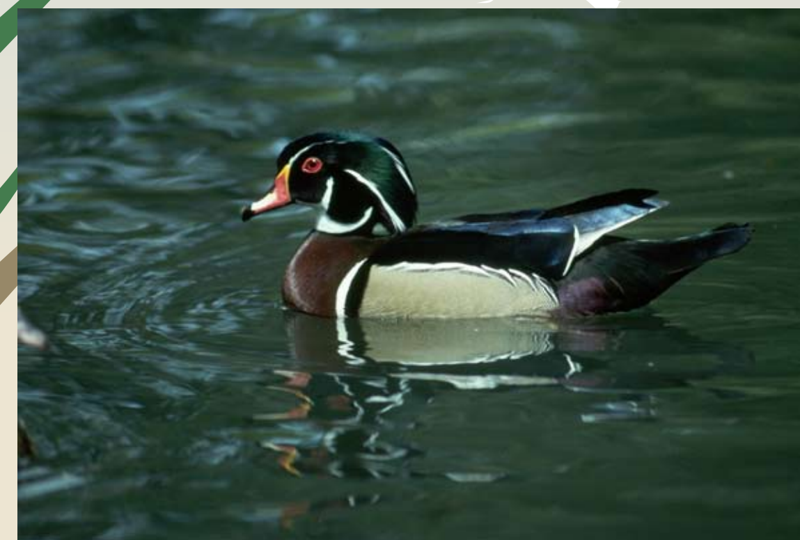
Male wood duck