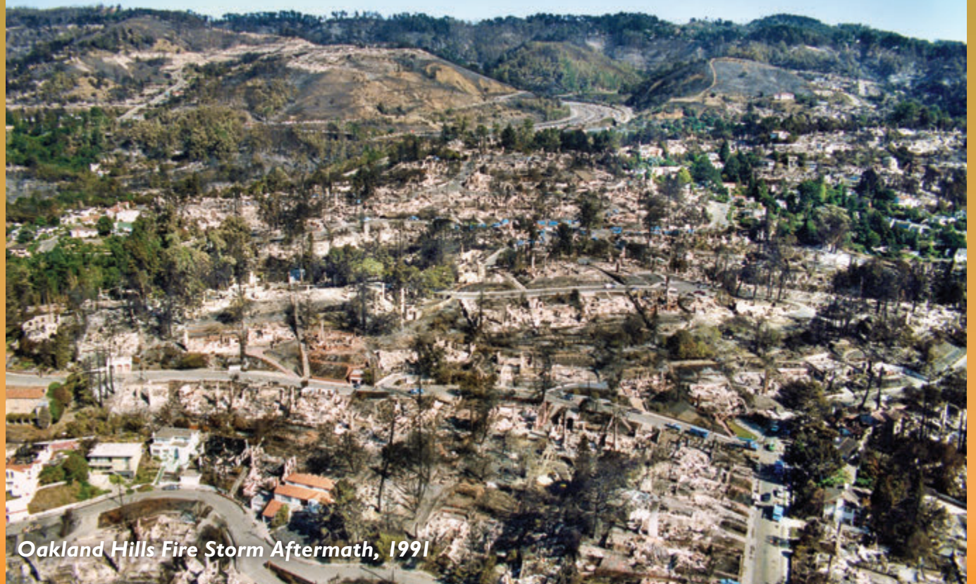
Oakland Hills Fire Storm Aftermath, 1991

Hills Emergency Forum: Hillsemergencyforum@comcast.net