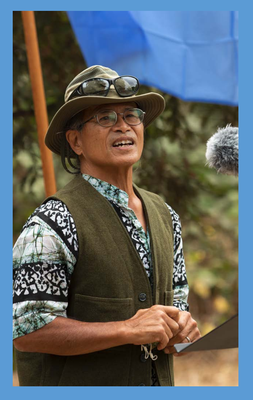
Sharing on Activating Peace Within Ourselves, at Home, in School and Community