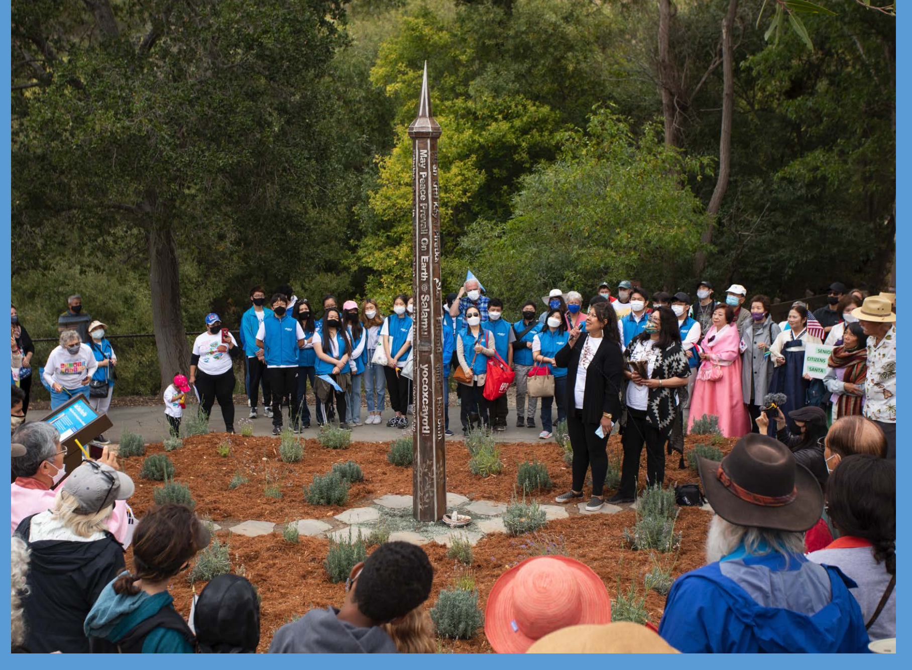
May Peace Prevail on Earth in Chochenyo: Píšen Kítti Káy'e Piretka